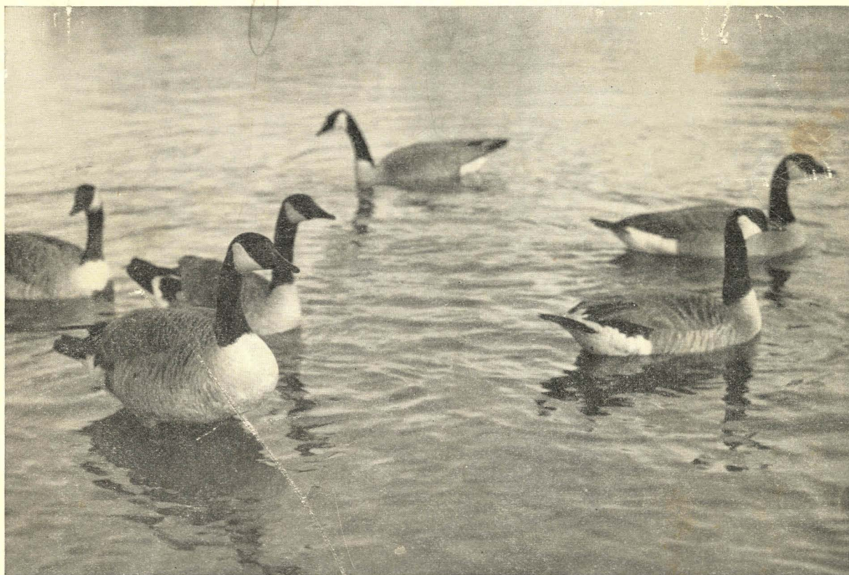
Wild Geese At State Fish Hatchery.